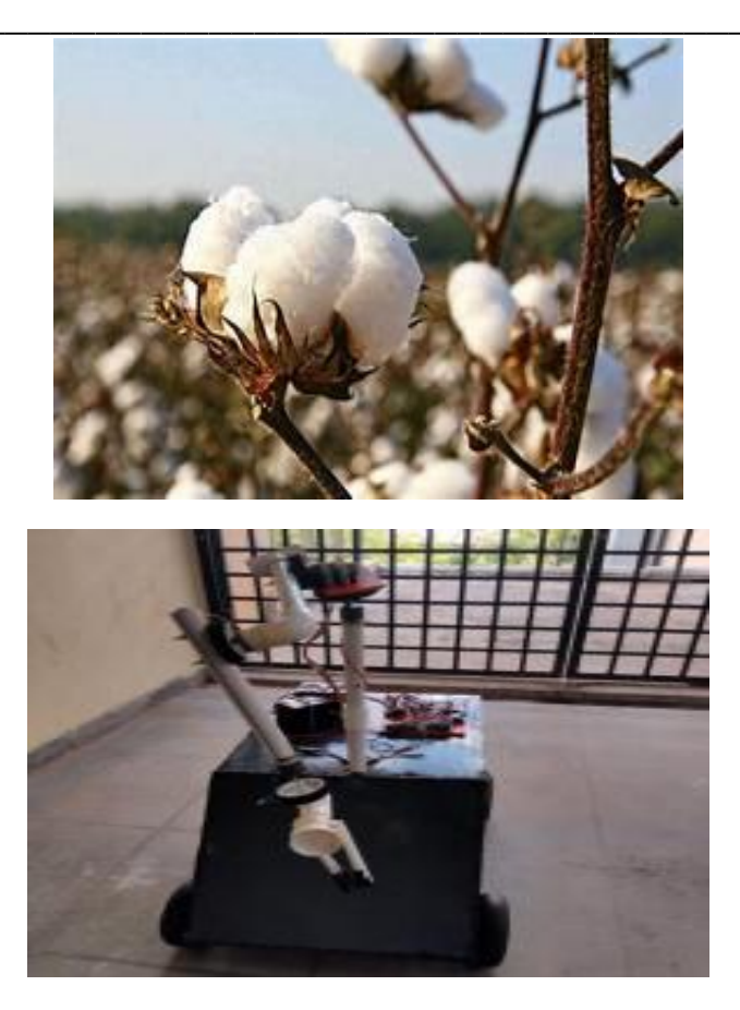
Fig 2: Model Images